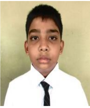
Het Bhanderi Std.-7A